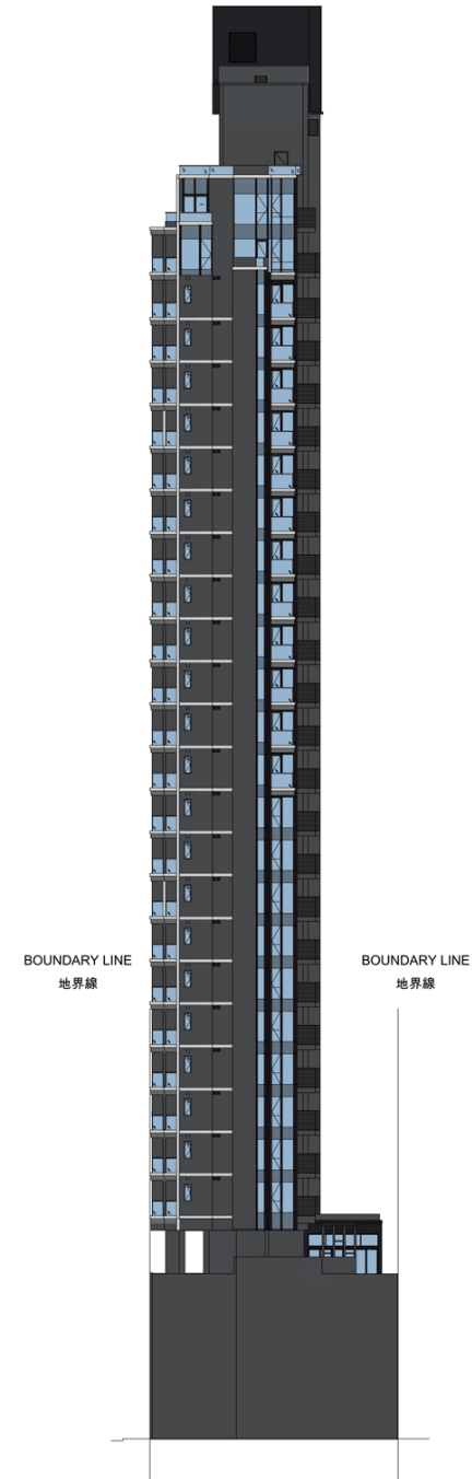
西南立面圖 South-West Elevation

Authorized Person for the development certified that the elevations shown on these elevation plans: