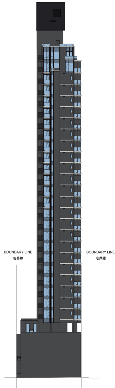
東北立面圖 North-East Elevation