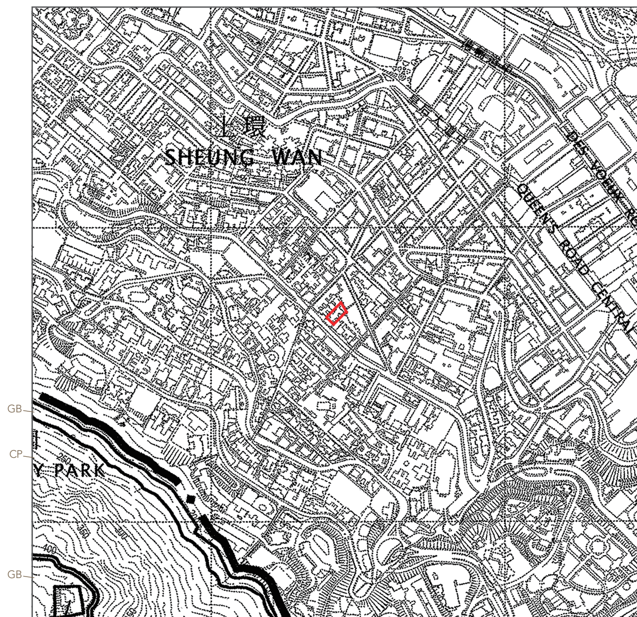
R(C)2 發展項目的位置 Location of the Development 比例：0M/米 Scale : 500M/米

備註：因技術性問題，此分區計劃大綱圖所顯示的範圍超過《一手住宅物業銷售條例》的規定。 Note : Due to technical reasons, this outline zoning plan has shown more than the area required under the Residential Properties (First-hand Sales) Ordinance.